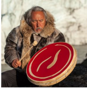
Angaangaq Angakkorsuaq (Kalaallit Nunaat Nation, Greenland)