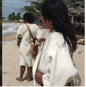
Kogi, Kagabba Nation (Colombia)